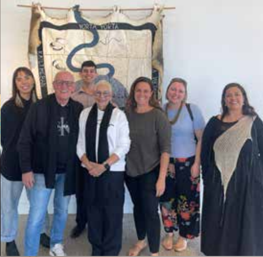
ural Centre, Image by Ian Han