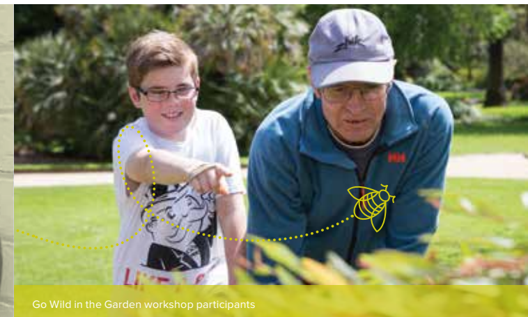
Go Wild in the Garden workshop participants